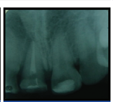
[Table/Fig-8]: Radiograph Showing Bone Regeneration Periapically

a fiber reinforced splint to allow some mobility, throughout the healing period [9]. A clinically stable mobility of the extruded teeth was present within the first month and it was maintained during the observation period. The non-rigid fixation which was used had a positive influence on the healing [10]. However, the clinical findings which are