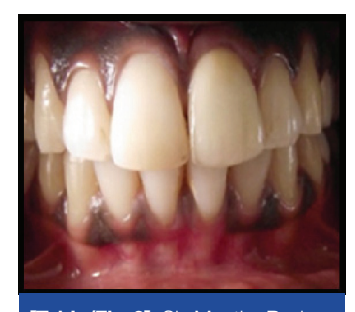
[Table/Fig-9]: Six Months Review

a fiber reinforced splint to allow some mobility, throughout the healing period [9]. A clinically stable mobility of the extruded teeth was present within the first month and it was maintained during the observation period. The non-rigid fixation which was used had a positive influence on the healing [10]. However, the clinical findings which are